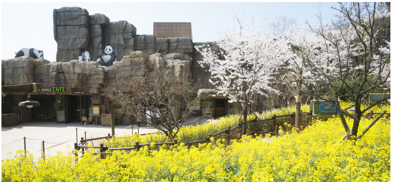
A curved path leads from Panda Plaza to the Otter Falls

Accordingly, the Panda World adventure starts at Panda Plaza. Here, Panda sculptures and F&B welcome visitors. The path to Otter Falls leads through a green, water-rich landscape modelled after China's Sichuan Province, home of the pandas. Once visitors have passed by the koi pond and the otter enclosure, they arrive at the informative and entertaining permanent exhibition, which is dedicated to all aspects of panda life and also educates visitors about species conservation.