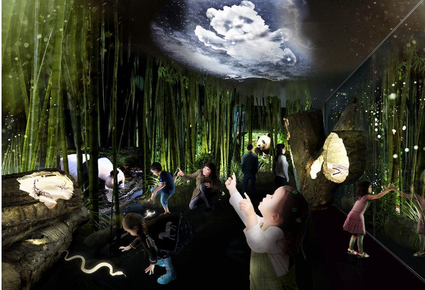
Twilight Experience (Visualisation)

Next up is Twilight Experience, which provides visitors a glimpse of the panda's nocturnal habitat—the only one of its kind in the world.